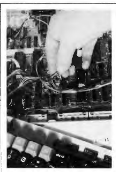
Connect the control wires